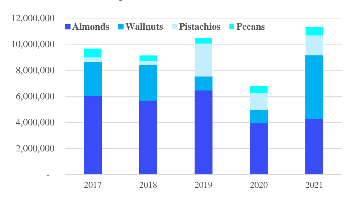
Chart 2. U.S. Tree Nuts Exported to Romania ($)